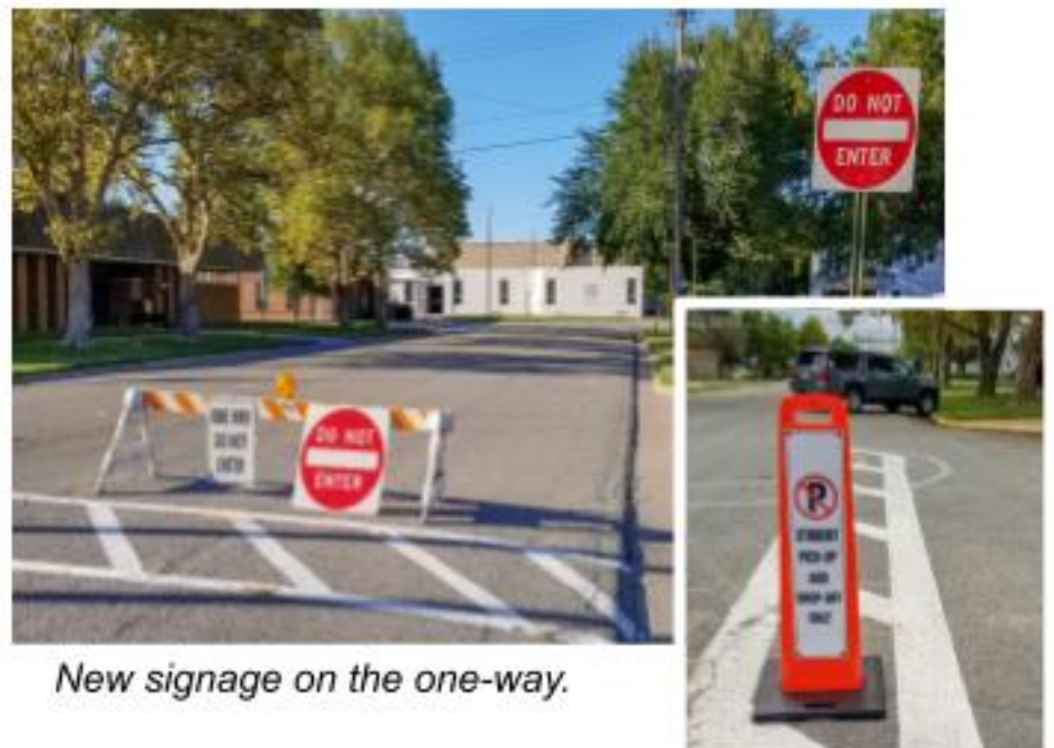
New signage on the one-way.

Changes made to the street by the city's public works department prior to school starting included adding