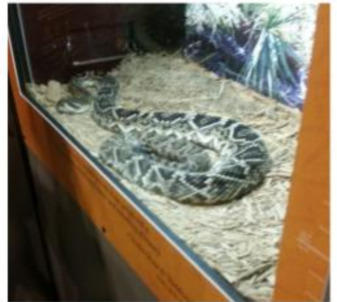
Right: A live rattlesnake from the Rattlesnake exhibit.