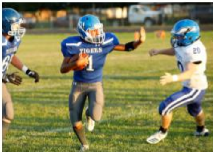
Below: High School Football vs Ness City.