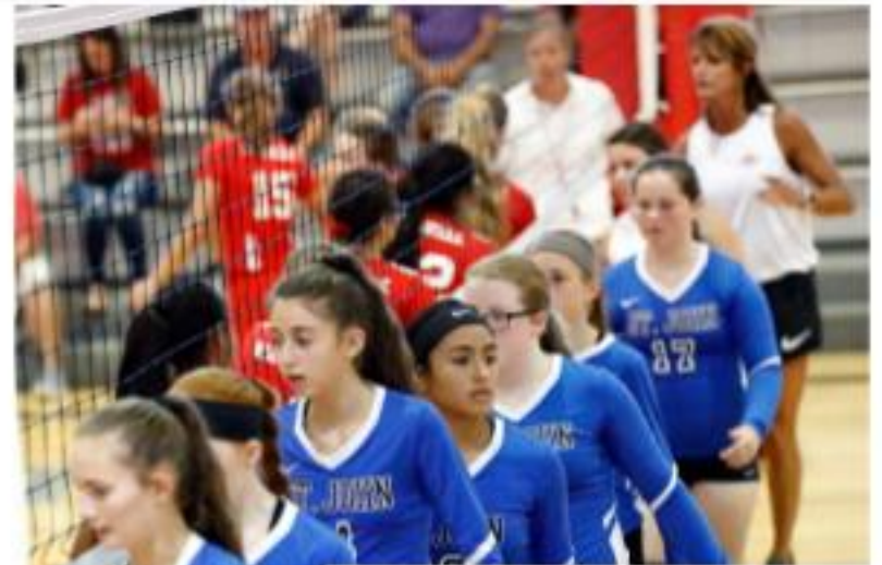
Junior High Volleyball at Macksville.